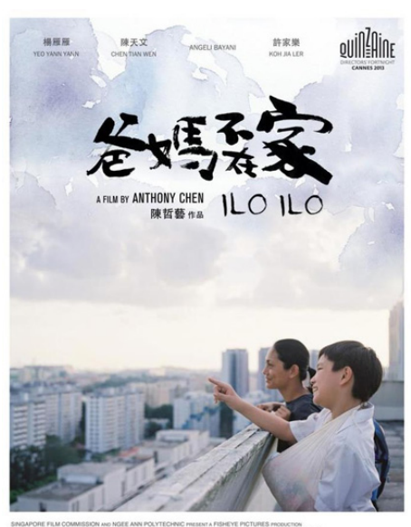
PRIADORE PILA COMMISSIONI NO NESSE ANT PONTTONNE PRESENT PREPIET ENTERNIS PROVIDENTE PROPERTY AND PROPERTY PROPERTY PROPERTY PROPERTY PROPERTY PROPERTY PROPERTY PROPERTY PROPERTY PROPERTY PROPERTY PROPERTY PROPERTY PROPERTY PROPERTY PROPERTY PROPERTY PROPERTY PROPERTY PROPERTY PROPERTY PROPERTY PROPERTY PROPERTY PROPERTY PROPERTY PROPERTY PROPERTY PROPERTY PROPERTY PROPERTY PROPERTY PROPERTY PROPERTY PROPERTY PROPERTY PROPERTY PROPERTY PROPERTY PROPERTY PROPERTY PROPERTY PROPERTY PROPERTY PROPERTY PROPERTY PROPERTY PROPERTY PROPERTY PROPERTY PROPERTY PROPERTY PROPERTY PROPERTY PROPERTY PROPERTY PROPERTY PROPERTY PROPERTY PROPERTY PROPERTY PROPERTY PROPERTY PROPERTY PROPERTY PROPERTY PROPERTY PROPERTY PROPERTY PROPERTY PROPERTY PROPERTY PROPERTY PROPERTY PROPERTY PROPERTY PROPERTY PROPERTY PROPERTY PROPERTY PROPERTY PROPERTY PROPERTY PROPERTY PROPERTY PROPERTY PROPERTY PROPERTY PROPERTY PROPERTY PROPERTY PROPERTY PROPERTY PROPERTY PROPERTY PROPERTY PROPERTY PROPERTY PROPERTY PROPERTY PROPERTY PROPERTY PROPERTY PROPERTY PROPERTY PROPERTY PROPERTY PROPERTY PROPERTY PROPERTY PROPERTY PROPERTY PROPERTY PROPERTY PROPERTY PROPERTY PROPERTY PROPERTY PROPERTY PROPERTY PROPERTY PROPERTY PROPERTY PROPERTY PROPERTY PROPERTY PROPERTY PROPERTY PROPERTY PROPERTY PROPERTY PROPERTY PROPERTY PROPERTY PROPERTY PROPERTY PROPERTY PROPERTY PROPERTY PROPERTY PROPERTY PROPERTY PROPERTY PROPERTY PROPERTY PROPERTY PROPERTY PROPERTY PROPERTY PROPERTY PROPERTY PROPERTY PROPERTY PROPERTY PROPERTY PROPERTY PROPERTY PROPERTY PROPERTY PROPERTY PROPERTY PROPERTY PROPERTY PROPERTY PROPERTY PROPERTY PROPERTY PROPERTY PROPERTY PROPERTY PROPERTY PROPERTY PROPERTY PROPERTY PROPERTY PROPERTY PROPERTY PROPERTY PROPERTY PROPERTY PROPERTY PROPERTY PROPERTY PROPERTY PROPERTY PROPERTY PROPERTY PROPERTY PROPERTY PROPERTY PROPERTY PROPERTY PROPERTY PROPERTY PROPERTY PROPERTY PROPERTY PROPERTY PROPERTY PROPERTY PROPERTY PROPERTY PROPERTY PROPERTY PROPERTY PROPERTY PROPERTY PROPERTY PROPERTY PROPERTY PROPERTY PROPERTY PROPERTY PROPERTY PROPERTY PROPERTY PROP

New Filmmaker Award at Asia ISFF / Award for Tomorrow's Cinema at Festival International du Film Indépendant, Brussels / Public Award for Best Short Film at Lyon Asian FF / Best Asian Short Film at Malaysian Video Awards